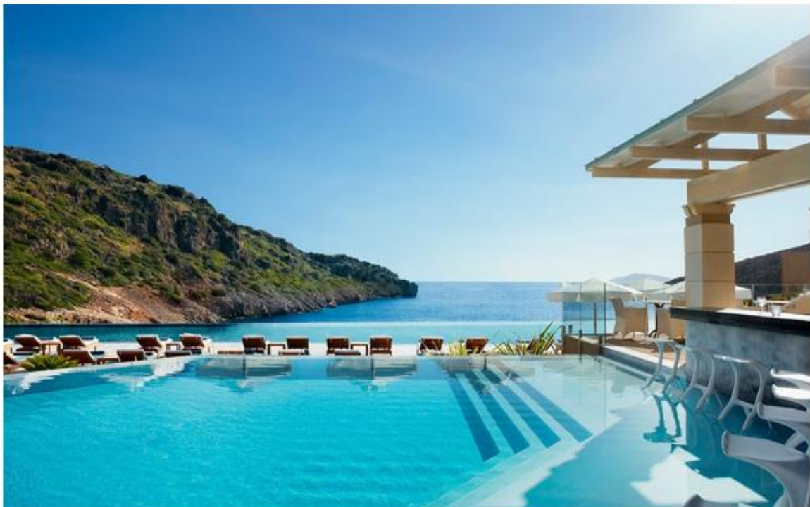
Amanzoe is an ultra-exclusive resort with an emphasis on health and wellbeing.