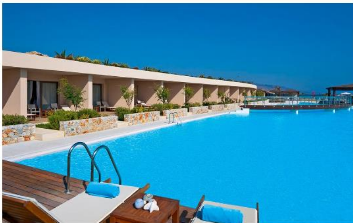
Cavo Spada Luxury Resort and Spa is surrounded by lush countryside and overlooks a pebble beach near Chania